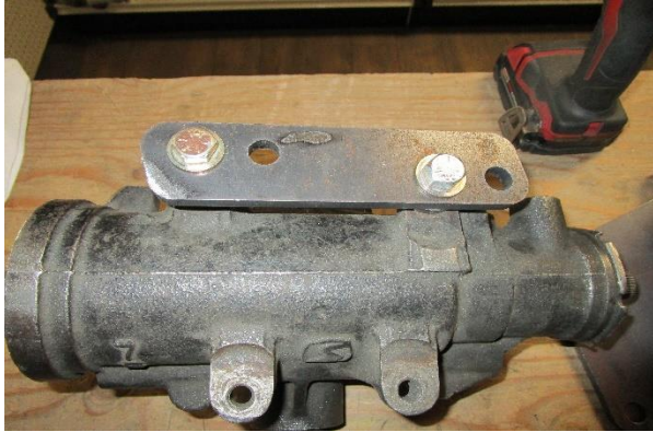
Figure 3 (1)