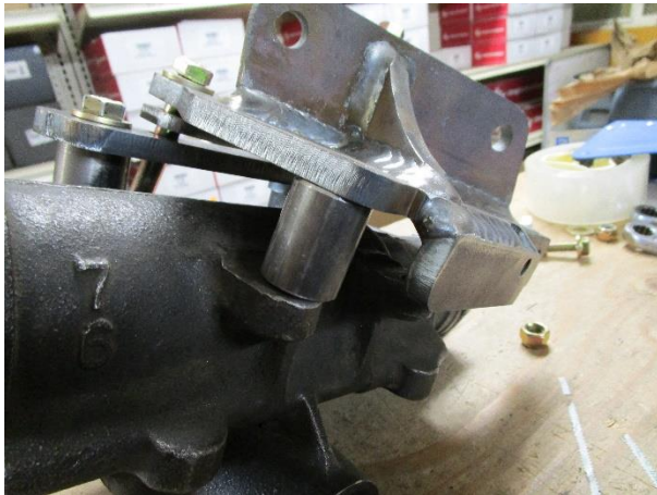
Figure 5 (1)