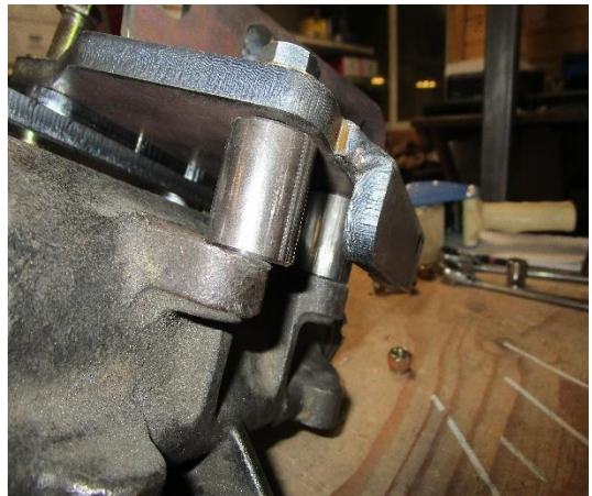
Figure 5 (2)