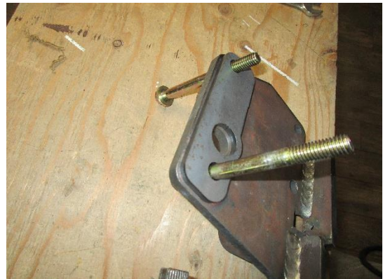
Figure 1 (1)